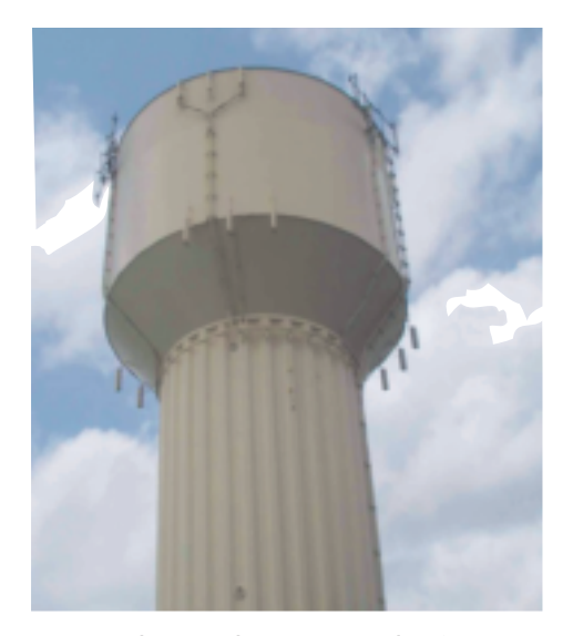
Typical Critical System Facility/Asset

Cleanup alone for a significant spill will run into the thousands of dollars, not to mention the long-term environmental impacts. Order of magnitude cost = $1 million to $10 million +