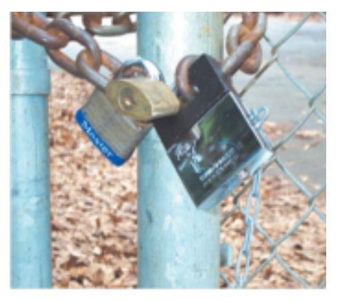
Example of Delay Is this Effective?